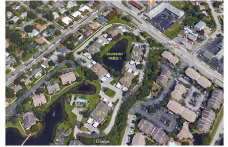
Built in 1984 - 48 units - 2 floors