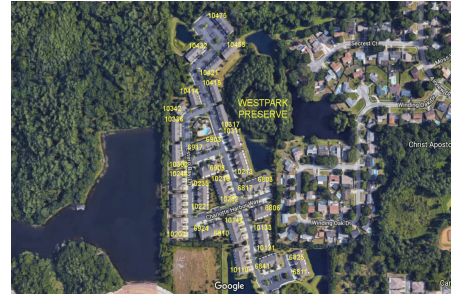
Built in 2012 - 196 units - 2 floors