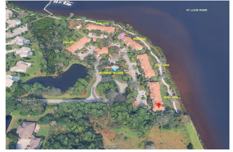
Built in 1986 - 40 units - 2 floors

Number of units: 40 Number of active listings for rent: 0 Number of active listings for sale: 0 Building inventory for sale: Number of sales over the last 12 months: 0%% Number of sales over the last 6 months: 2 Number of sales over the last 3 months: 2 Bayhead Village Condominiums https://