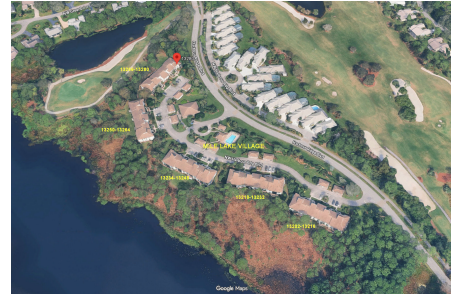
Built in 1987 - 40 units - 2 floors

Number of units: 40 Number of active listings for rent: 0 Number of active listings for sale: 0 Building inventory for sale: Number of sales over the last 12 months: 0%% Number of sales over the last 6 months: 0 Number of sales over the last 3 months: 0 Mile Lake Village https://