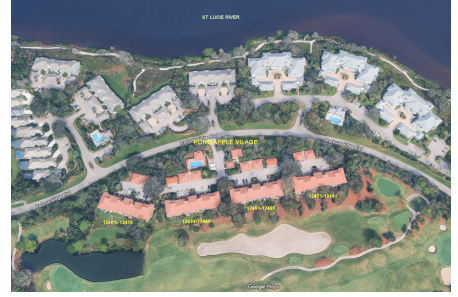
Built in 1988 - 32 units - 2 floors

Number of units: 32 Number of active listings for rent: 0 Number of active listings for sale: 2 Building inventory for sale: 6% Number of sales over the last 12 months: 1 Number of sales over the last 6 months: 0 Number of sales over the last 3 months: 0 Pond Apple Village https://