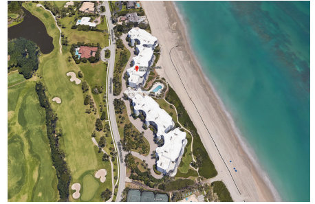
Built in 1981 - 62 units - 4 floors