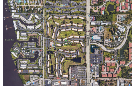
Built in 1971 - 510 units - 2 floors

Number of units: 510 Number of active listings for rent: 0 Number of active listings for sale: 5 Building inventory for sale: 0% Number of sales over the last 12 months: 15 Number of sales over the last 6 months: 9 Number of sales over the last 3 months: 5 King Mountain Condominium Association 1991 SW Palm City Rd, Stuart, FL 34994 (772) 283-8963 https://