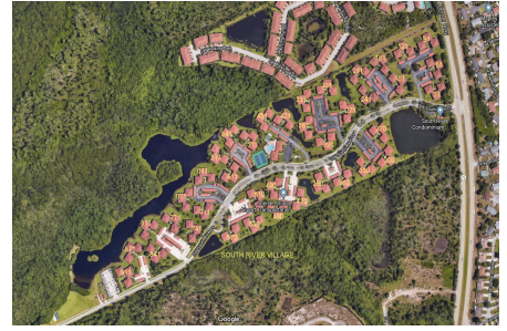
Built in 1981/1989 - 546 units - 2 floors

SOUTH RIVER CONDOMINIUMS Telephone: 772.283.9253. Fax: 772.283.0095. https://www.southernrivercondo.com/