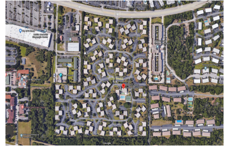
Built in 1970 - 522 units - 2 floors

Number of units: 522 Number of active listings for rent: 2 Number of active listings for sale: 10 Building inventory for sale: 1% Number of sales over the last 12 months: 20 Number of sales over the last 6 months: 9 Number of sales over the last 3 months: 4 Vista Pines Condominium Association Address: 2600 SE Ocean Blvd, Stuart, FL 34996 Phone: +1 772-283-4198 https://www.vistapines.com/