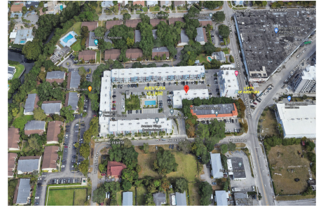
Built in 2020 - 114 units - 6 floors

Number of units: 114 Number of active listings for rent: 5 Number of active listings for sale: 10 Building inventory for sale: 8% Number of sales over the last 12 months: 3 Number of sales over the last 6 months: 1 Number of sales over the last 3 months: 1 Aventura Village Address: 19380 NE 26th Ave, Miami, FL 33180 Phone: +1 954-865-8122 https://