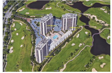
Built in 1975 - 272 units - 27 floors

Coronado Condominium Association 20301 W Country Club Dr Aventura, FL 33180 Phone number (305) 931-5900 https://csimsi.ahn01.com/coronadofl/outside_home.asp