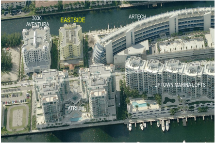
Built in 2007 - 39 units - 8 floors