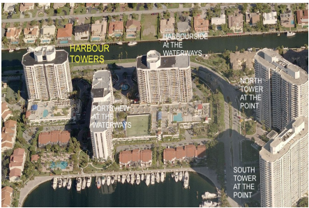
Built in 1993 - 144 units - 19 floors