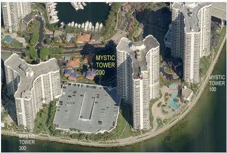
Built in 1989 - 353 units - 30 floors

Number of units: 353 Number of active listings for rent: 5 Number of active listings for sale: 18 Building inventory for sale: 5% Number of sales over the last 12 months: 20 Number of sales over the last 6 months: 9 Number of sales over the last 3 months: 6 Mystic Pointe Tower 200 Condominium (305)933-9042 & (305) 933-9531 https://