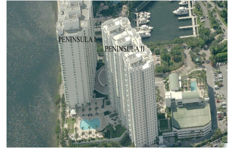
Built in 2007 - 223 units - 30 floors