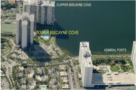
Built in 1981 - 262 units - 27 floors