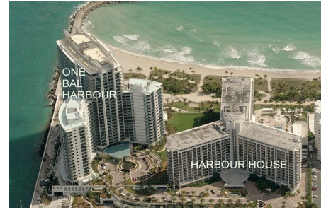
Built in 2007 - 309 units - 25 floors

Number of units: 309 Number of active listings for rent: 2 Number of active listings for sale: 7 Building inventory for sale: 2% Number of sales over the last 12 months: 6 Number of sales over the last 6 months: 3 Number of sales over the last 3 months: 3 One Bal Harbour 10275 Collins Ave, Bal Harbour, FL33154 (305) 865-4700 https://