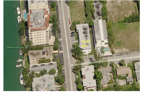
Built in 1956 - 12 units - 2 floors