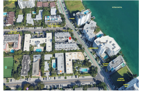
Built in 2019 - 14 units - 4 floors