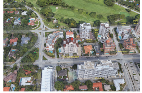
Built in 1990 - 23 units - 14 floors

Number of units: 23 Number of active listings for rent: 0 Number of active listings for sale: 0 Building inventory for sale: Number of sales over the last 12 months: 0% Number of sales over the last 6 months: 0 Number of sales over the last 3 months: 0 Biltmore Regent Condominium Address: 721 Biltmore Way, Coral Gables, FL 33134 Phone: +1 305-444-4674 https://