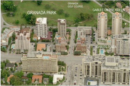
Built in 1982 - 32 units - 14 floors

Number of units: 32 Number of active listings for rent: 0 Number of active listings for sale: 0 Building inventory for sale: Number of sales over the last 12 months: 0%% Number of sales over the last 6 months: 0 Number of sales over the last 3 months: 0 Granada Park Condominium (305) 444-2302 https://