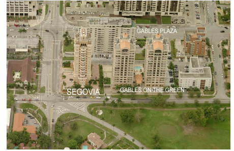
Built in 1998 - 15 units - 15 floors