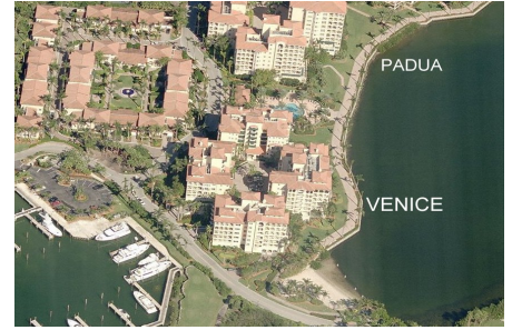
Built in 1993 - 44 units - 7 Floors