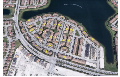
Built in 2008 - 317 units - 2 floors