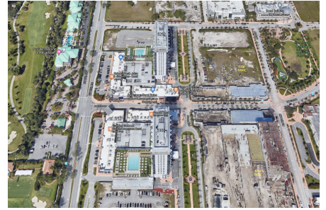
Built in 2016 - 203 units - 21 floors