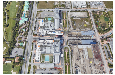
Built in 2016 - 219 units - 21 floors