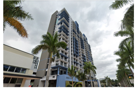
Built in 2019 - 238 units - 20 floors