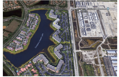
Built in 2002 - 70 units - 5 floors

Number of units: 70 Number of active listings for rent: 3 Number of active listings for sale: 4 Building inventory for sale: 5% Number of sales over the last 12 months: 8 Number of sales over the last 6 months: 4 Number of sales over the last 3 months: 3 Doral Isles Community Association Address: 6450 NW 110th Ave, Doral, FL 33178, Phone: +1 305-436-091 https://