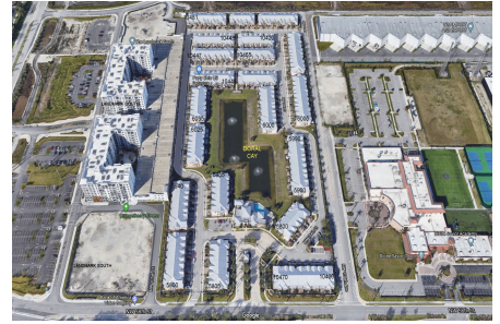
Built in 2013 - 158 units - 2 floors