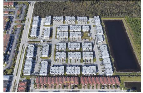
Built in 2016 - 142 units - 2 floors

Doral Palms 5630 NW 102 Ave Doral, FL 33178 (305) 471-0208 Management Company (786)-310-5261 https://www.doralpalms.com/