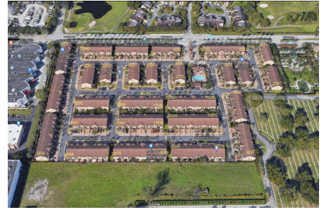
Built in 2006 - 176 units - 2 floors

Milan By Lennar Homeowners Association, Inc 5805 Blue Lagoon Drive Miami, FL 33126 (305) 269-8633 Allied Property Group 12350 SW 132 Court, Suite 114 Miami, Florida 33186 https://milanbylennar.alliedpropertygroup.net/