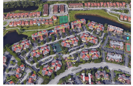
Built in 1989 - 301 units - 5 floors

Number of units: 301 Number of active listings for rent: 5 Number of active listings for sale: 2 Building inventory for sale: 0% Number of sales over the last 12 months: 10 Number of sales over the last 6 months: 5 Number of sales over the last 3 months: 1 West Fontaine Condo Condominium Management 10253 NW 9th Street Cir, Miami, FL 33172 (305) 552-0760 https://westfontaine.org/