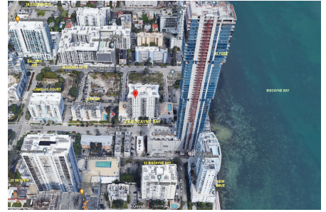
Built in 2012 - 96 units - 18 floors

23 Biscayne Bay Condo Address: 601 NE 23rd St, Miami, FL 33137 Phone: +1 305-438-9220