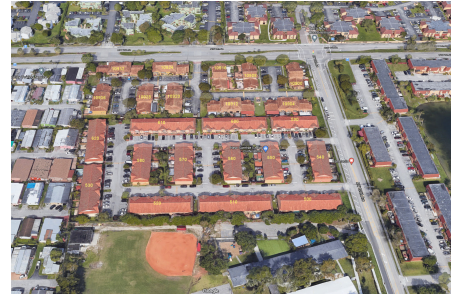
Built in 1986 - 120 units - 2 floors

Number of units: 120 Number of active listings for rent: 0 Number of active listings for sale: 1 Building inventory for sale: 0% Number of sales over the last 12 months: 1 Number of sales over the last 6 months: 1 Number of sales over the last 3 months: 1 Patio Grande Townhomes Condominium Association, Inc Address: 175 Fontainebleau Blvd, Miami, FL 33172 https://