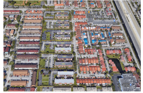
Built in 1988/90 - 312 units - 4 floors

Number of units: 312 Number of active listings for rent: 4 Number of active listings for sale: 2 Building inventory for sale: 0% Number of sales over the last 12 months: 5 Number of sales over the last 6 months: 4 Number of sales over the last 3 months: 3 Alameda Tower 1 Condominium Association, Inc 5300 West 21st Court Hialeah, FL 33016 (305) 819-2361 Alameda Tower IV Condominium 5500 W 21st Ct, Hialeah, FL 33016, +1 305-817-8873 https://