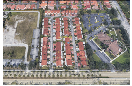
Built in 1996 - 53 units - 2 floors

Number of units: 53 Number of active listings for rent: 0 Number of active listings for sale: 0 Building inventory for sale: Number of sales over the last 12 months: 0% Number of sales over the last 6 months: 0 Number of sales over the last 3 months: 0