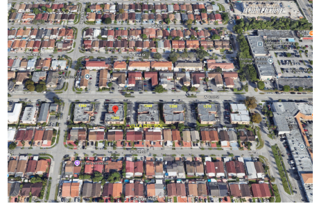
Built in 1987 - 70 units - 2 floors

VILLA DEL SOL CONDOMINIUM ASSOCIATION, Inc. C/O Watson Association Management 430 NW Lake Whitney Place Port St. Lucie, Fl. 34986 772-871-0004 https://