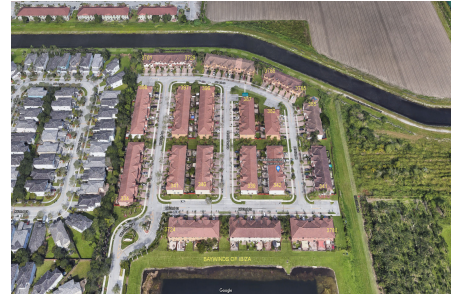
Built in 2008/2013 - 113 units - 2 floors