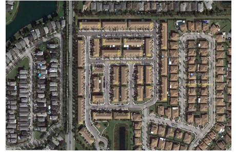
Built in 2018 - 188 units - 2 floors