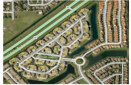
Built in 2005 - 384 units - 2 floors