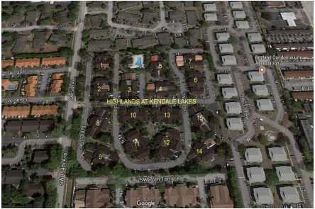
Built in 1985 - 200 units - 2 floors