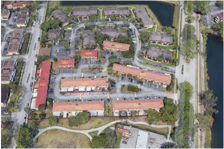
Built in 1996/2000 - 54 units - 2 floors