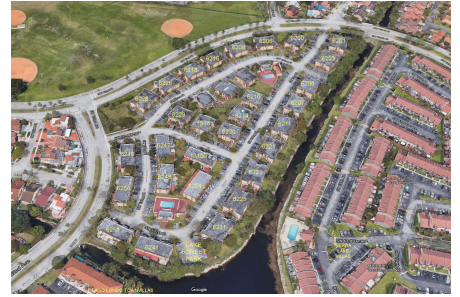
Built in 1989 - 224 units - 2 floors