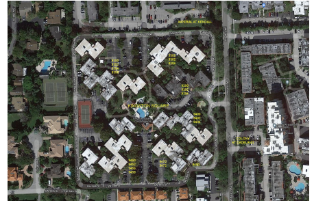
Built in 1967 - 162 units - 3 floors

Number of units: 162 Number of active listings for rent: 3 Number of active listings for sale: 3 Building inventory for sale: 1% Number of sales over the last 12 months: 12 Number of sales over the last 6 months: 4 Number of sales over the last 3 months: 2 Kingston Square Condominiums Address: 9304 SW 77th Ave, Miami, FL 33156, Phone: +1 305-553-9731 https://