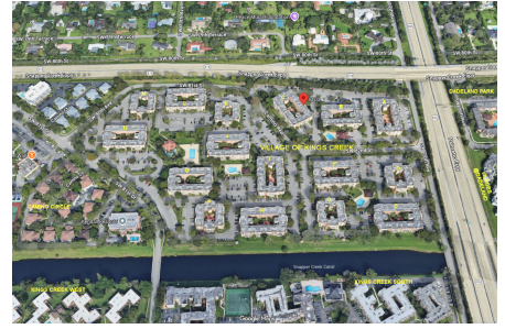
Built in 1972 - 544 units in total - 4 floors

Village of Kings Creek 7711 Camino Real Miami, FL 33143 (305) 279-3411 https://www.kcvmiami.org/