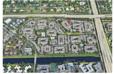
Built in 1972 - 522 units - 4 floors

Number of units: 522 Number of active listings for rent: 7 Number of active listings for sale: 0 Building inventory for sale: Number of sales over the last 12 months: 0% Number of sales over the last 6 months: 3 Number of sales over the last 3 months: 0 Village of Kings Creek Association 7711 Camino Real Miami, FL 33143 (305) 279-3411 https://www.kcvmiami.org/