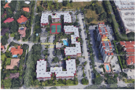
Built in 1977 - 234 units - 4 floors

Number of units: 234 Number of active listings for rent: 2 Number of active listings for sale: 0 Building inventory for sale: Number of sales over the last 12 months: 6% Number of sales over the last 6 months: 3 Number of sales over the last 3 months: 3 Wisperwood Village Condominium 9301 SW 92nd Ave Miami, FL 33176 Office: 305-274-8990 Fax: 305-595-0791 wisperwood@fostercompany.net https://www.wisperwoodvillage.com/