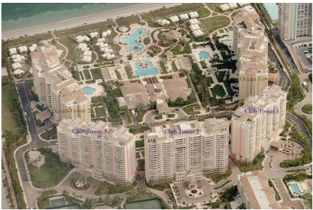
Built in 1999 - 95 units - 18 floors

https://www.oceanclubkeybiscayne.org/Default.aspx?p=DynamicModule&pageid=301066&s