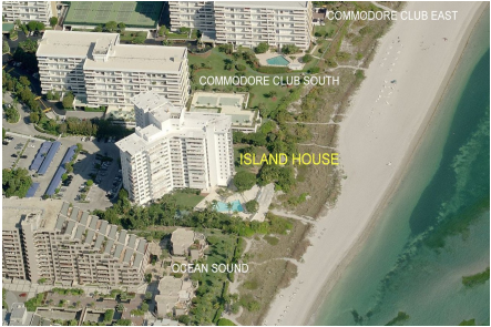
Built in 1961 - 118 units - 14 floors