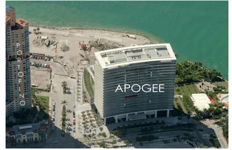
Built in 2008 - 67 units - 23 floors

Number of units: 67 Number of active listings for rent: 0 Number of active listings for sale: 4 Building inventory for sale: 5% Number of sales over the last 12 months: 2 Number of sales over the last 6 months: 2 Number of sales over the last 3 months: 0 Apogee Condominium Association Inc 305-674-1163. https://www.apogeecondomiami.com/